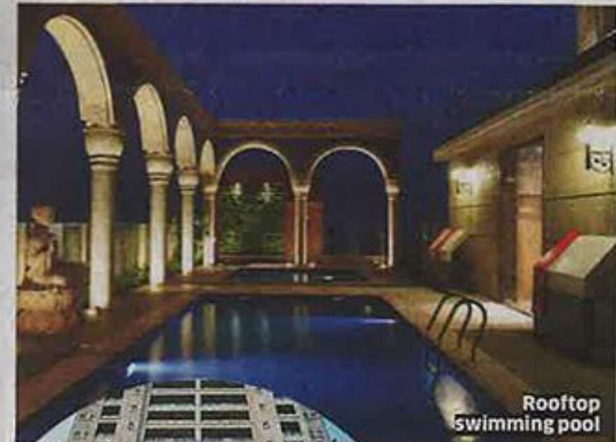
Rooftop swimming pool