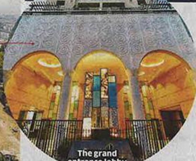
The grand entrance lobby